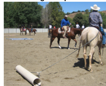
Willing Partners™ horses demonstrate in the Riding with Respect clinic Aug. 2010